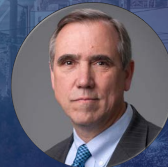
Jeff Merkley, U.S. Senator